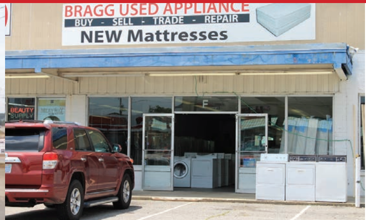
409 N Bragg Blvd., Spring Lake 910-339-2201