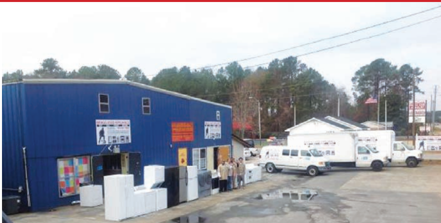
7051 Cliffdale Road, Fayetteville 910-867-7668