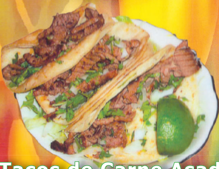
Tacos de Carne Asada