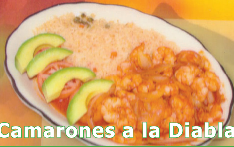
Camarones a la Diabla