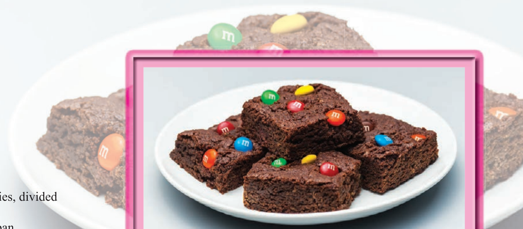
Ultimate Peanut Butter Brownies

— Pans Matter — Bake cookies on light-colored, non-insulated cookie sheets without sides. Metal pans will cook brownies faster than glass pans, which means cooking times will vary. Start checking your brownies early to test if they're ready and prevent over baking. You can find more sweet baking tips and recipes at www.facebook.com/mms .